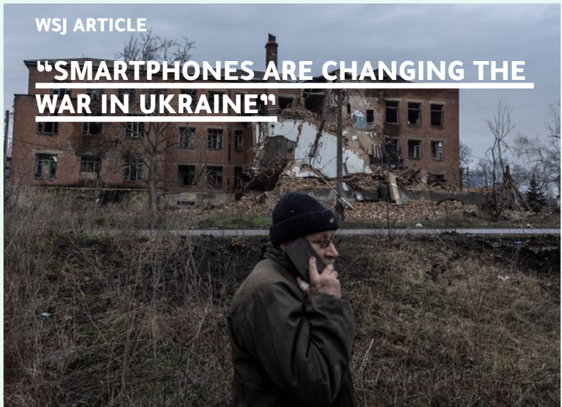
Cellphones have been a crucial tool for civilians as the fighting has raged in Bakhmut, eastern Ukraine.

THE PROGRAM HAS BEEN FEATURED IN VARIOUS MEDIA ARTICLES AND PIECES, INCLUDING: